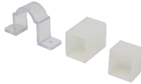
Mounting clips and end caps